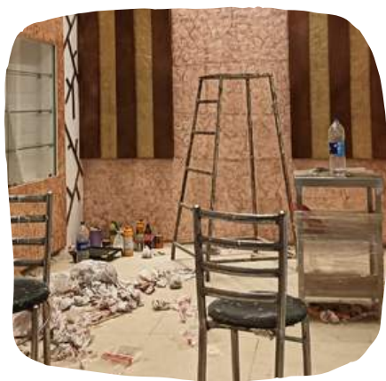
RENOVATION OF SURYODAY

The objective of the Livelihood Program is to reduce inequality by generating employment among the youths with and without disabilities. The livelihood program is functioning basically in two-parts, first part is Vocational skill training unit and second one is production unit. Vocational skill training unit is designed to equip people with disabilities and from marginalized communities, thus empowering them to lead a life with dignity and independence. It has designed to provide training in a variety of fields such as carpentry, horticulture, Bakery, Grihani, tailoring, and other vocational skills. While in the production part, we established four production units naming wood workshop, art & design, Café, and food preservation unit in alignment to provide the employment for the people who challenged with disability.